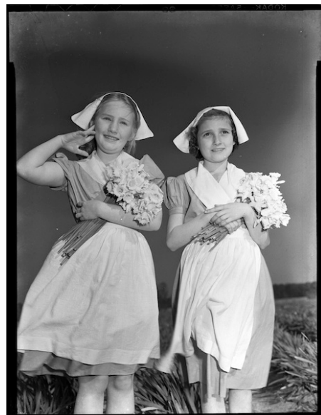
Dutch immigrants at Castle Hayne, 1940s-1950s