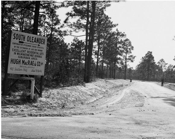
Whites-only Oleander development near Wilmington http://dc.lib.unc.edu/u/?/morton_highlights,5781

That's what fascinates us about Hugh Morton's grandfather. Most prominent white supremacists argued that the Wilmington race riot and the white supremacy campaigns of 1898-1900 settled the state's "race problem" for good. Flush with victory, Josephus Daniels hailed "permanent good government by the party of the white man." On the eve of his gubernatorial election in 1900, Charles Aycock, too, was ready to move forward. He said that, "We have ruled by force, we can rule by fraud, but we want to rule by law."