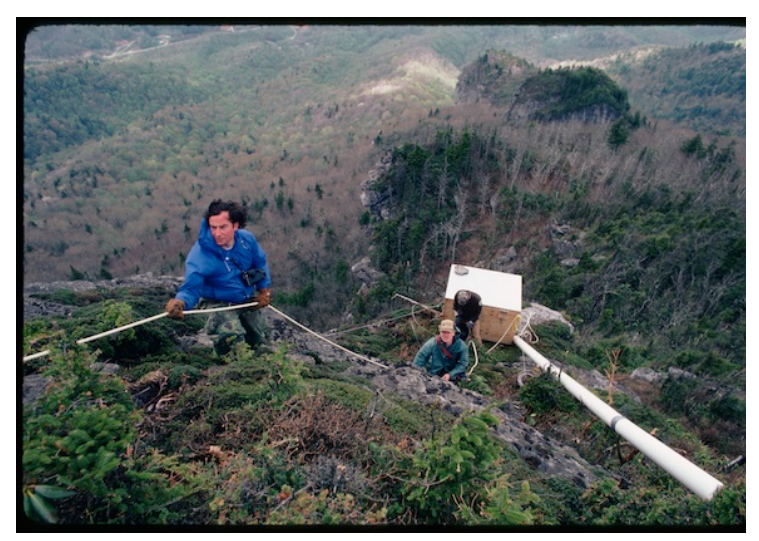
Grandfather Mountain peregrine falcon site construction, 1984 http://dc.lib.unc.edu/u?/morton_highlights,7089

In 1987, a study of hikers at Grandfather Mountain and Linville Gorge Wilderness appeared in the influential Journal of Leisure Research. Research by the Virginia Polytechnic Institute School of Forestry informed the ongoing national debate over recreation user fees by showing that hikers strongly supported fees if they prevented deterioration of trails (a "dedicated fee," in recreation management jargon). Grandfather's trail program registered a 98% fee compliance rate during the study.