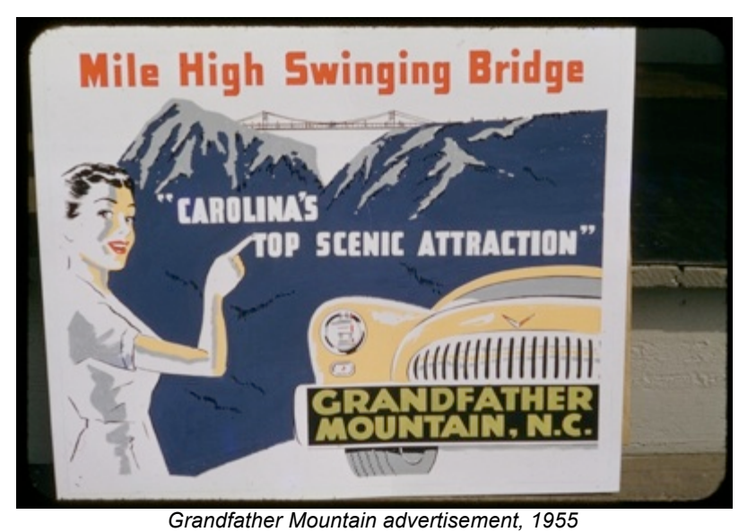
Grandfather Mountain advertisement, 1955 http://dc.lib.unc.edu/u?/morton_highlights,1424

Building trails, interpretative centers, and the famous Mile-High Swinging Bridge,