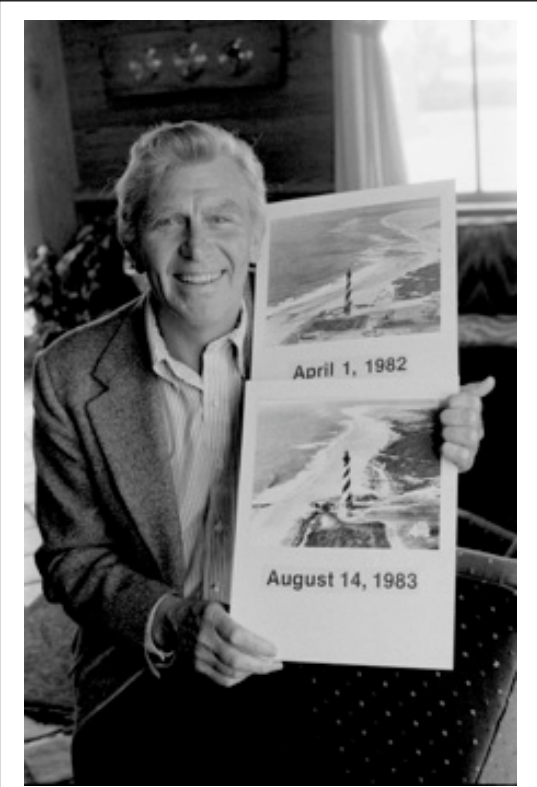
Andy Griffith with Cape Hatteras posters