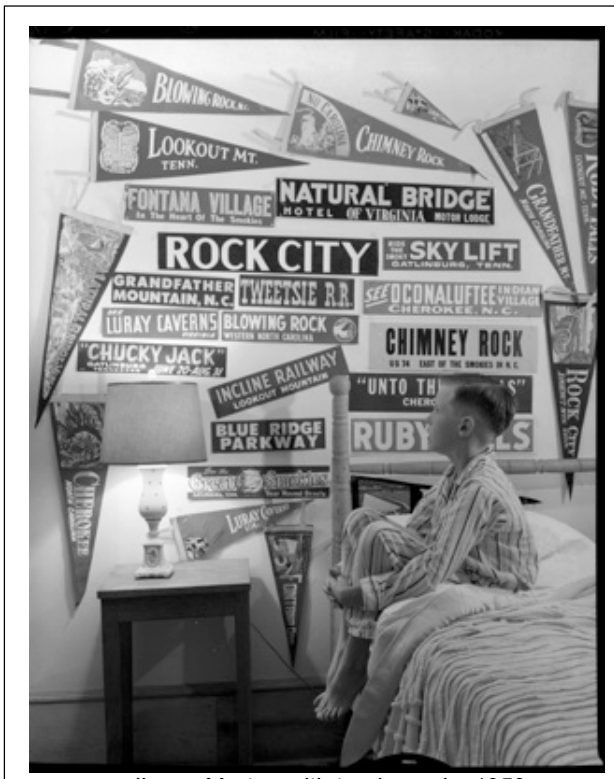
Jimmy Morton with tourism ads, 1959 http://dc.lib.unc.edu/u?/morton_highlights,1877