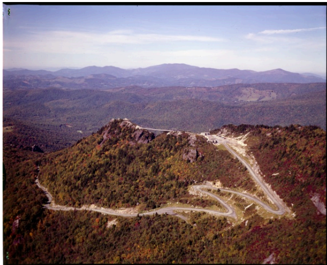
Grandfather Mountain, road to summit, 1960s-1970s http://dc.lib.unc.edu/u/?morton_highlights,4487