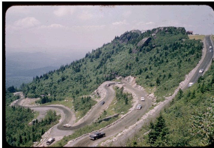
Grandfather Mountain, road to summit with cars, 1950s http://dc.lib.unc.edu/u/?/morton_highlights.3150

Morton's own images, at last, provide visual evidence of Parkway supporters' claims. They show Grandfather's peak before the road, blasting and tree removal, and the new road with its cuts, fills, rock, and cars ascending. Aerial photographs add a sense of perspective, while a series of other pictures remind us of how nearby private interests stood to lose – and gain – from building of a federally funded scenic auto Parkway: photos of the newly organized Grandfather "Hill Climb" car race, of a large new sign erected about 1959 at Linville to advertise the attraction, of merchandise in the bigger 1960s "Top Shop," and 1970s traffic congestion at the top of the mountain.