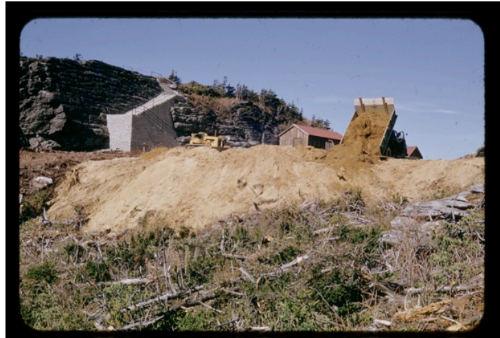
Grandfather Mountain construction, early 1950s http://dc.lib.unc.edu/u/?morton_highlights,2959

Perusing the images from the Morton collection, one can appreciate the dramatic physical transformation brought to Grandfather's summit by the development of "Carolina's Top Scenic Attraction." That attraction, its Park Service critics pointed out, had caused considerable damage to the mountain at an elevation higher than the planned Parkway "high route." And despite employing some language decrying the "great scar" the Parkway would cause, Morton in the 1950s and 1960s worried most that the high route would, as he noted in correspondence, "interfere with our attraction" and "kill the development."